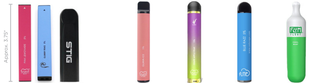
Puff Bar, Wave Bar, STIG 270-400 puffs

Disposable vaping devices are designed for single use. Devices come fully charged and pre-filled with nicotine solutions. When e-juice is gone, the device can be thrown away.